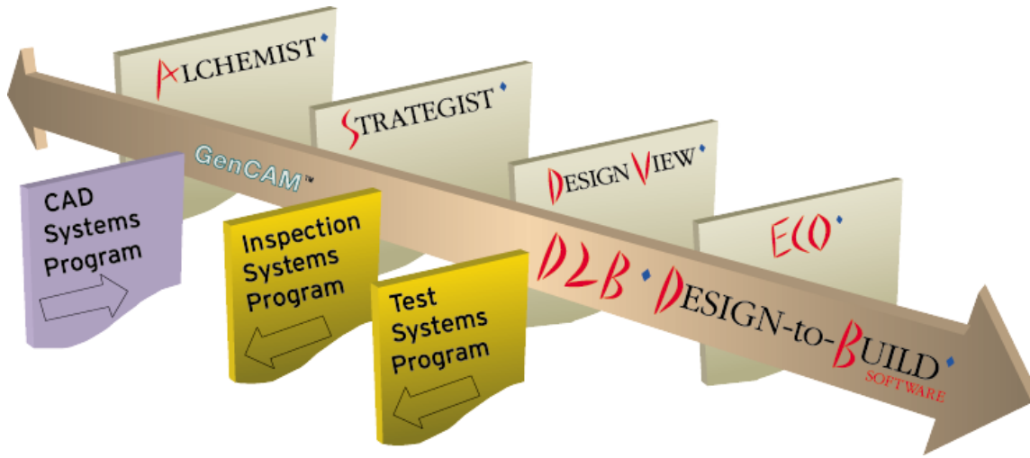
Teradyne's Design-to-Build (D2B) modular framework