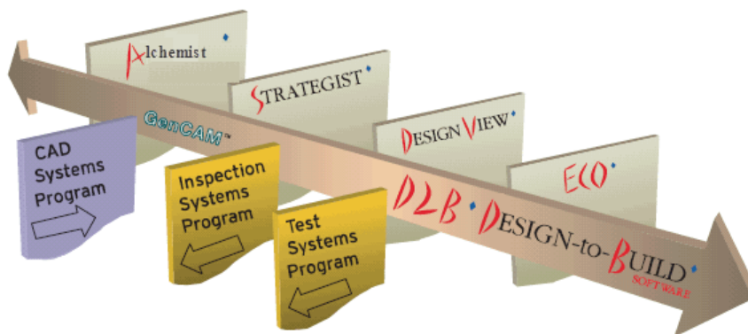
D2B's Modular Framework

For more information on our Design-to-Build suite of software solutions, please go to www.teradyne.com .